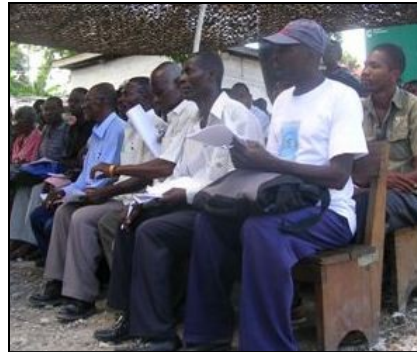
Health Workers at Training

This was the first opportunity for 4 of our employees to put in practice what they learned at a 3 day training of trainers conducted by UNICEF and DINEPA (Ministry of Water and Sanitation). They learned about participatory methods for training others about waterborne disease transmission cycle and methods of breaking that cycle. Then they trained about 85 health agents and supervisors using what they learned."