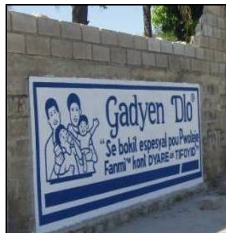
Technicians (left), Gadyen Dlo Mural (above)