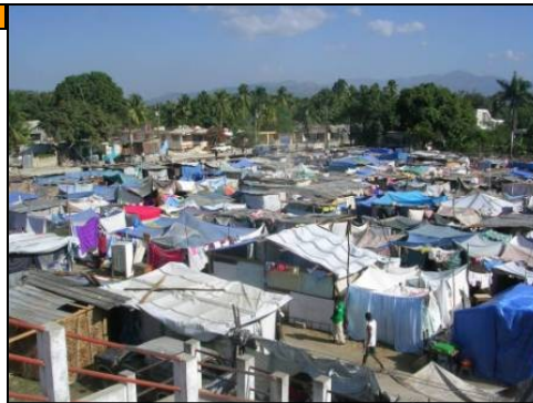
Tent City in Leogane, Haiti

Escalating Crisis: The events of January 12, 2010 have affected the Haitian people deeply in the past few months and will for years to come. There is no way to accurately portray the emotional, physical and economic devastation. Before the earthquake one in 9 children died before their 5th birthday in rural Haiti. About one child died every hour and a half from diarrhea-related dehydration, and one primary cause of diarrhea is unsafe water. Since the earthquake the availability of clean water has decreased due to damage to water sources and an increase in population in rural areas as homeless Haitians migrate to the countryside. Deep Springs is answering the call to expand our water treatment model, filling a great need in the